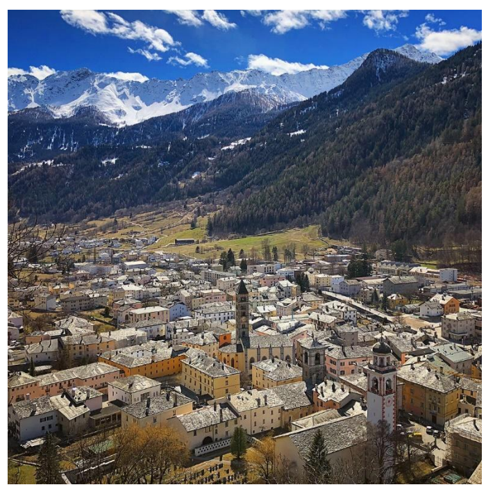
View of the village of Poschiavo, a garden in a neighbourhood and the entrance to the Polo Poschiavo training centre.