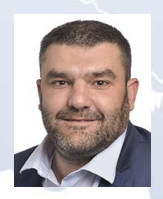
Jérémy Decerle (Renew Europe)