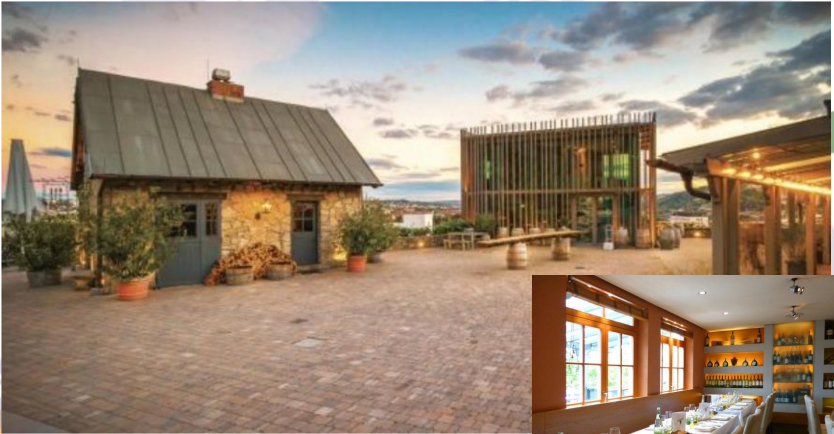
Reisers- Restaurant am Stein