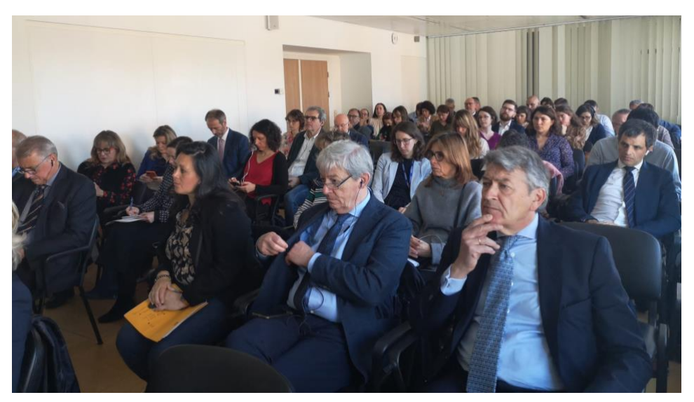
Participants at the 1st AREPO General Assembly of 2024